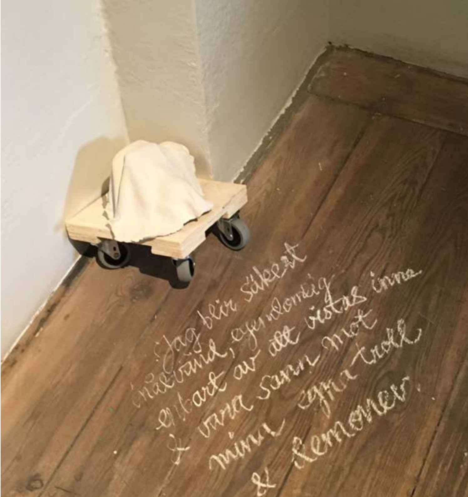
"Vit vagn i hörn" mixed media