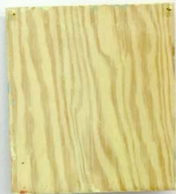
Ur serien kvadrater till Sylvia