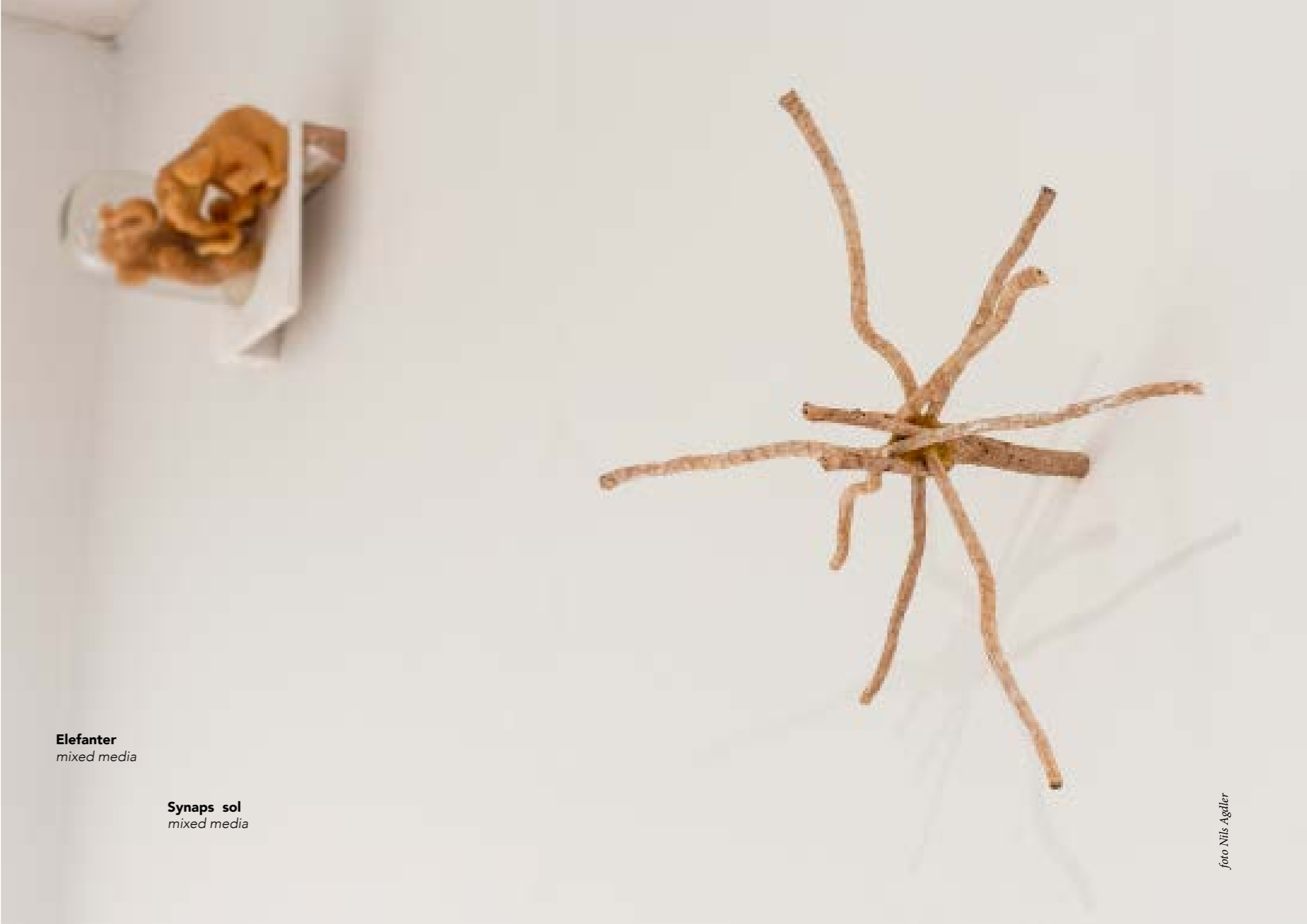
Elefanter mixed media